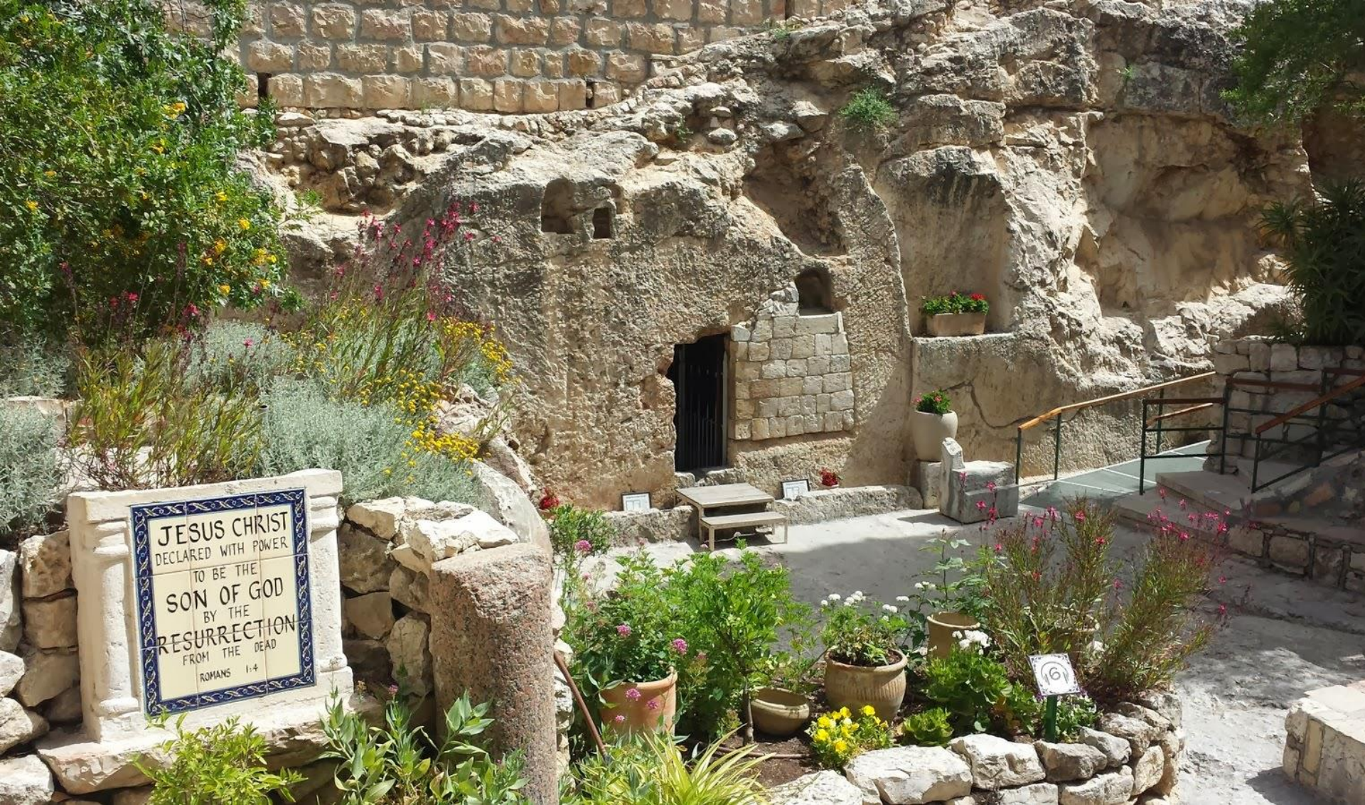
The garden tomb